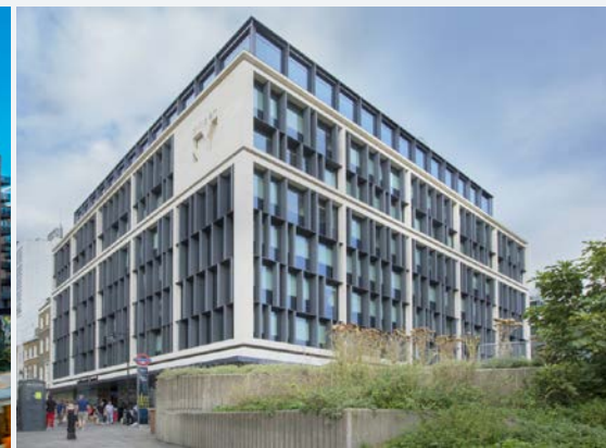
Number of staff: 1,300 Type of work: Engineering, design and consultancy